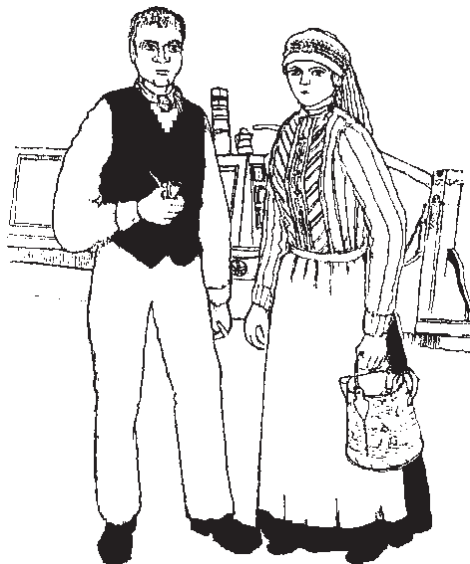
Between loading the barges and feeding the horses, the old bargees always made time for tea.

Served with a Mixed Green Salad, Tomato and Coleslaw, with a Roll & Butter.