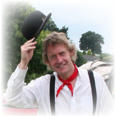
“The Last Horse-Drawn Bargeman in the Westcountry”